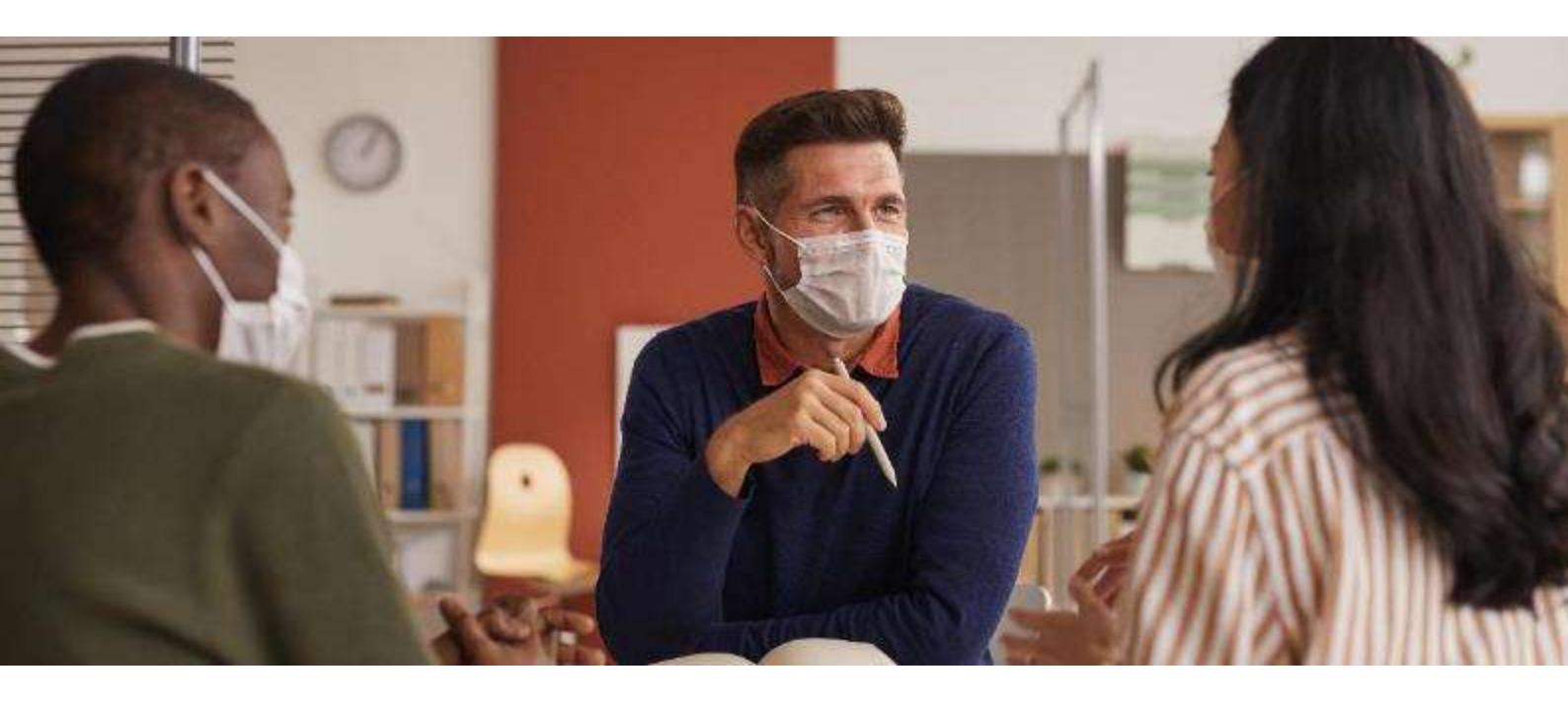
Edition 1 Current as at 16 August 2021

Helping you and your business navigate the Australian COVID-19 vaccine rollout in an ever-changing landscape